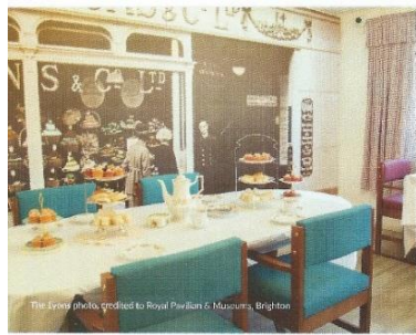
The Living photo

This leaflet is printed on heavy paper, and is A4 folded into three.