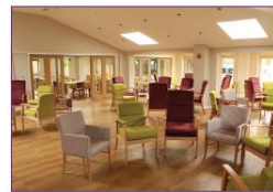
Rooms at Raleigh House can be hired for meetings and events. Contact us for more information.